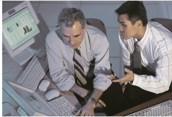
The Write Source